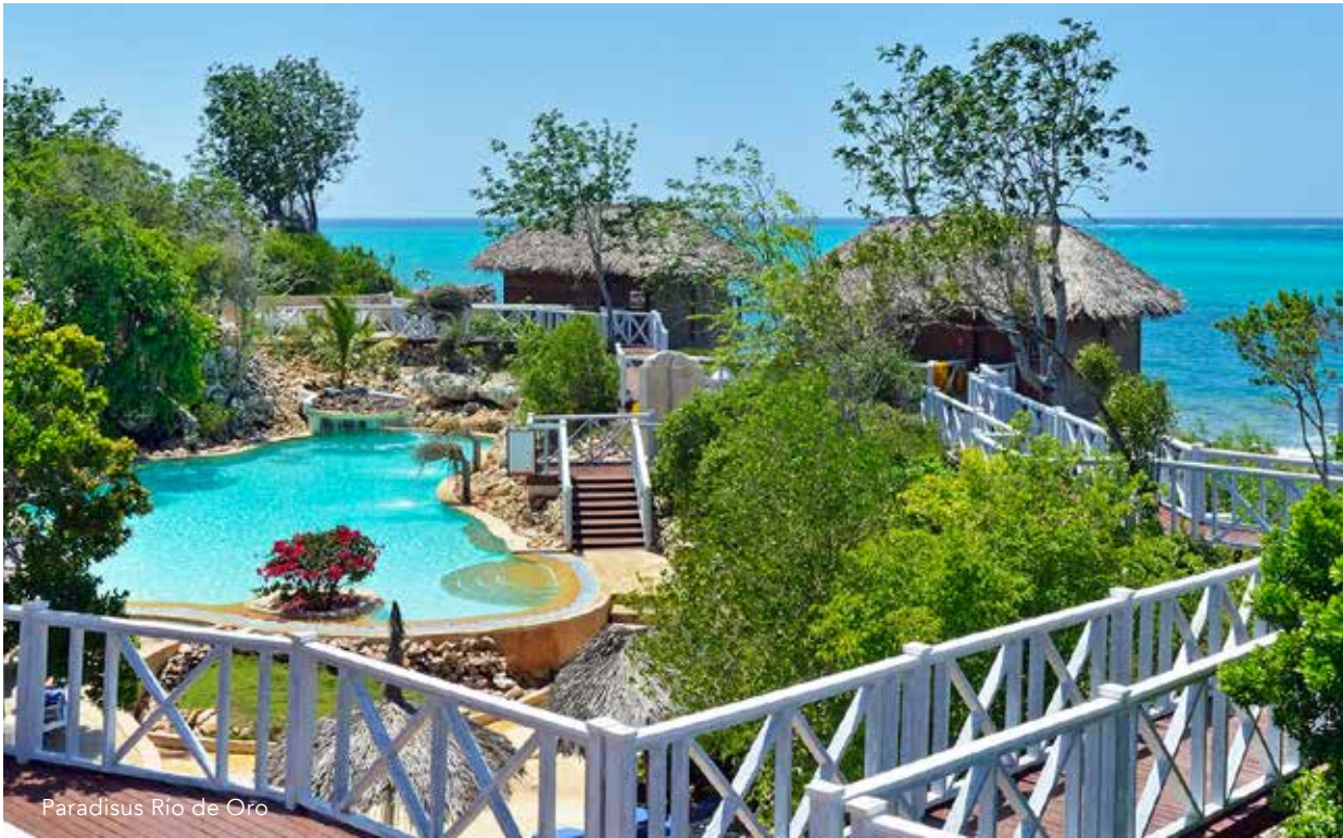
Paradisus Río de Oro

Nestled in amongst some of Cuba’s most famous landscapes, Paradisus’ Cuban offerings include an adults only eco resort, idyllic natural surroundings, spa and scuba diving packages.