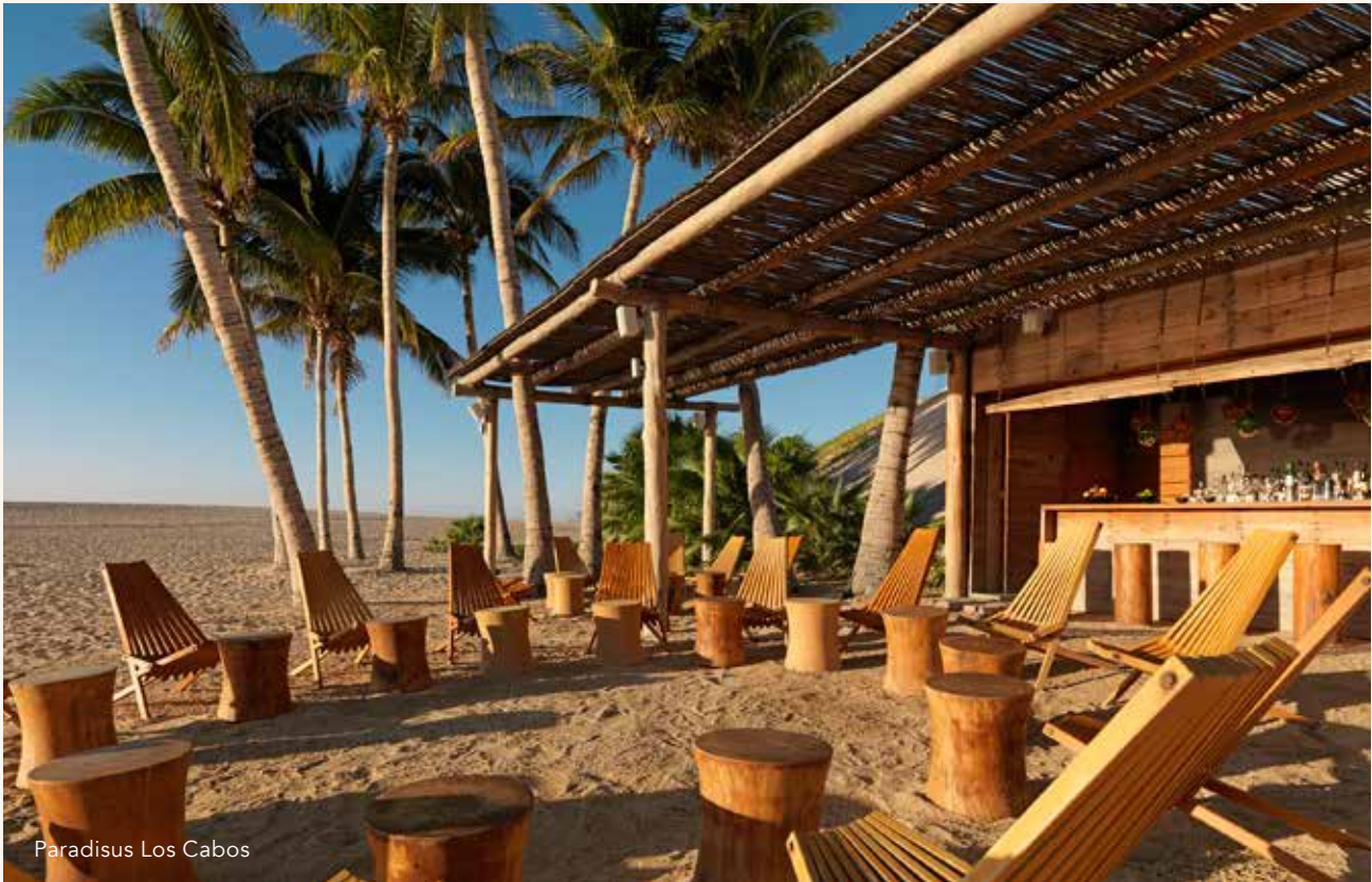
Paradisus Los Cabos