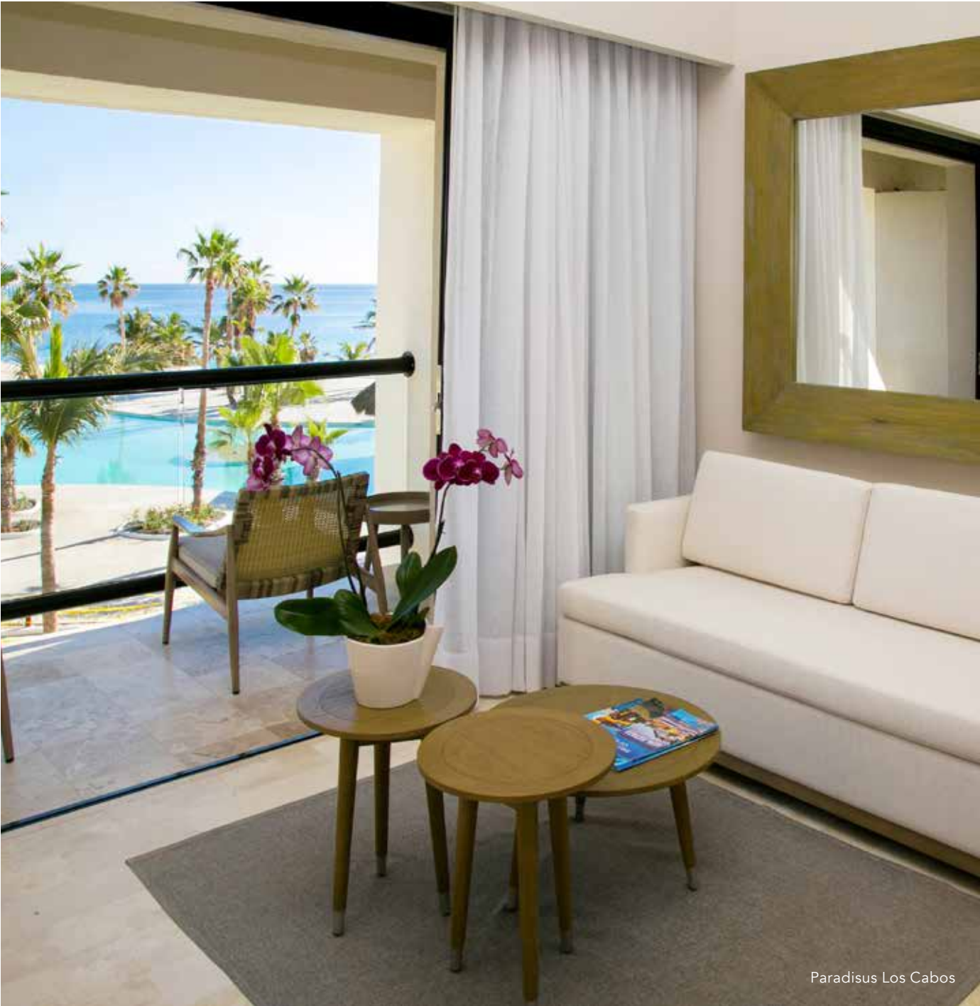
Paradisus Los Cabos

Paradisus’ additional services offer a non-exhaustive list of luxury possibilities, whether you are looking to upgrade a romantic getaway or make lifelong memories for the whole family.