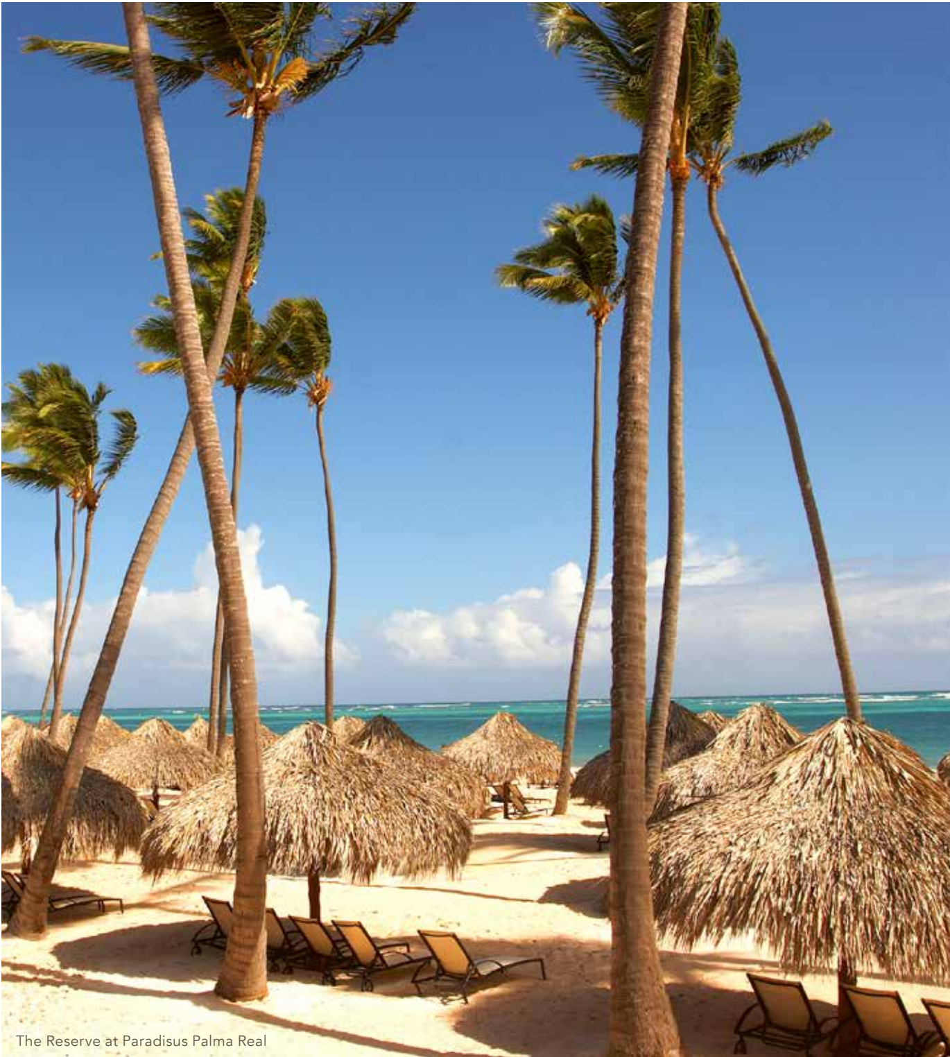
The Reserve at Paradisus Palma Real

Paradisus takes luxury resort experiences to new levels, all dictated by the desire to upgrade and enhance their stay - to pamper, reconnect, lavish and relax.