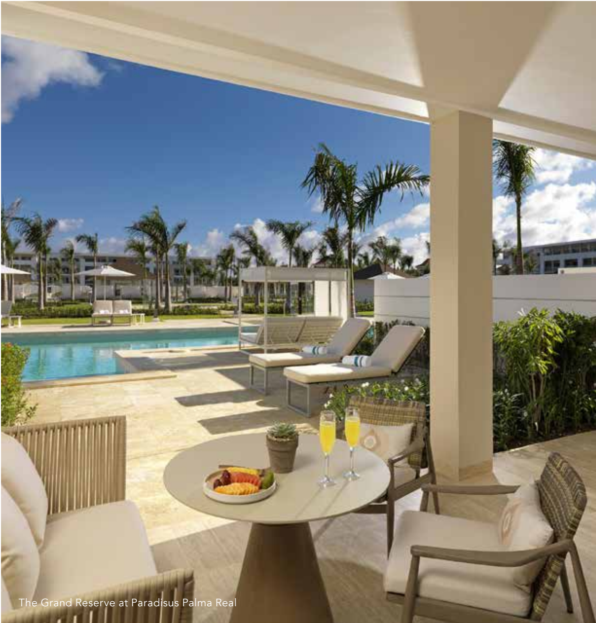
The Grand Reserve at Paradisus Palma Real

Boasting seven resorts, including the adults-only La Perla, Mexico’s suite of Paradisus resorts includes luxury facilities such as a 9-hole golf course, a private bay, eco-friendly classes on the hotel’s conservation program and Michelin-starred chefs-fronted restaurants.