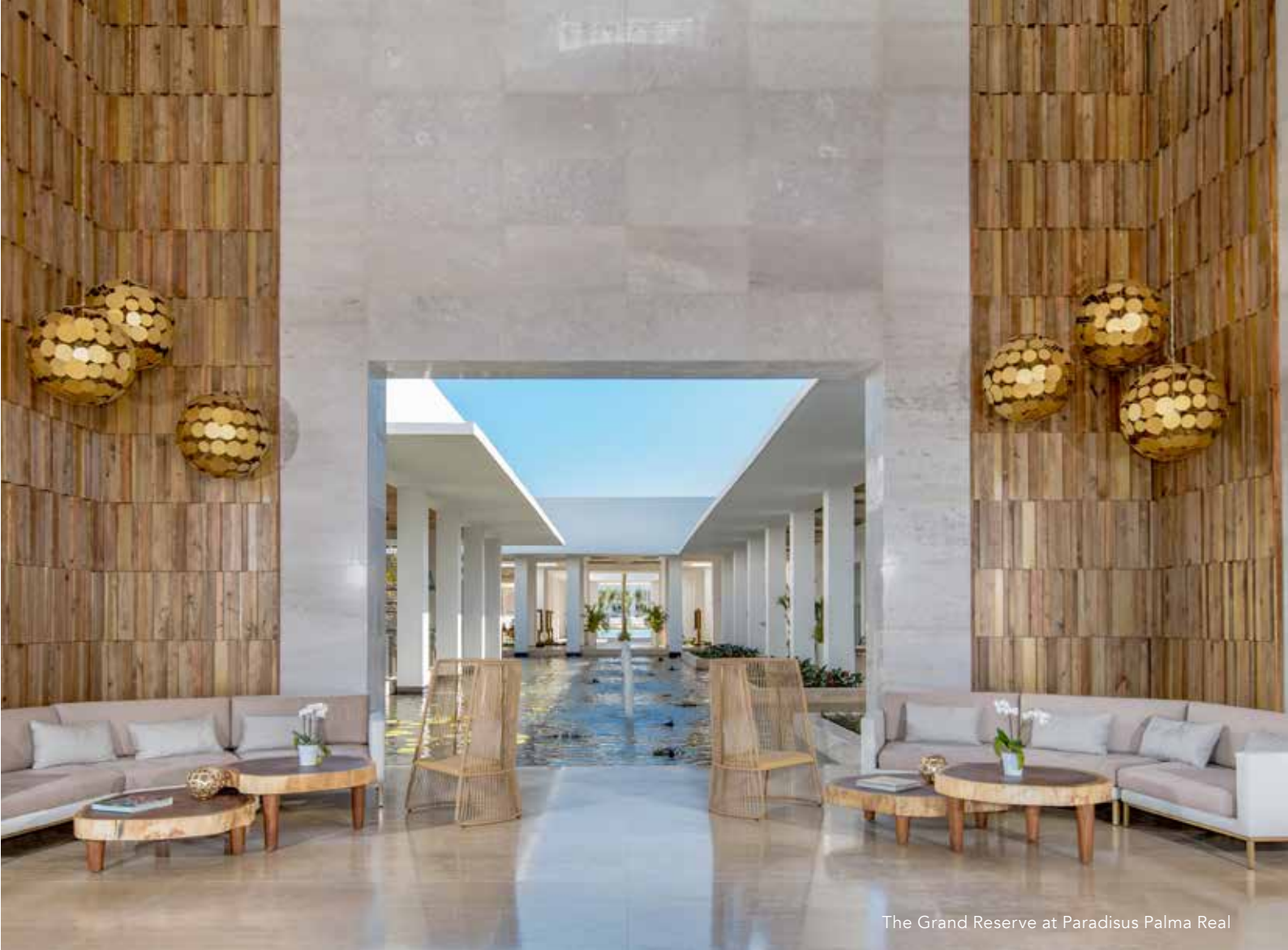
The Grand Reserve at Paradisus Palma Real