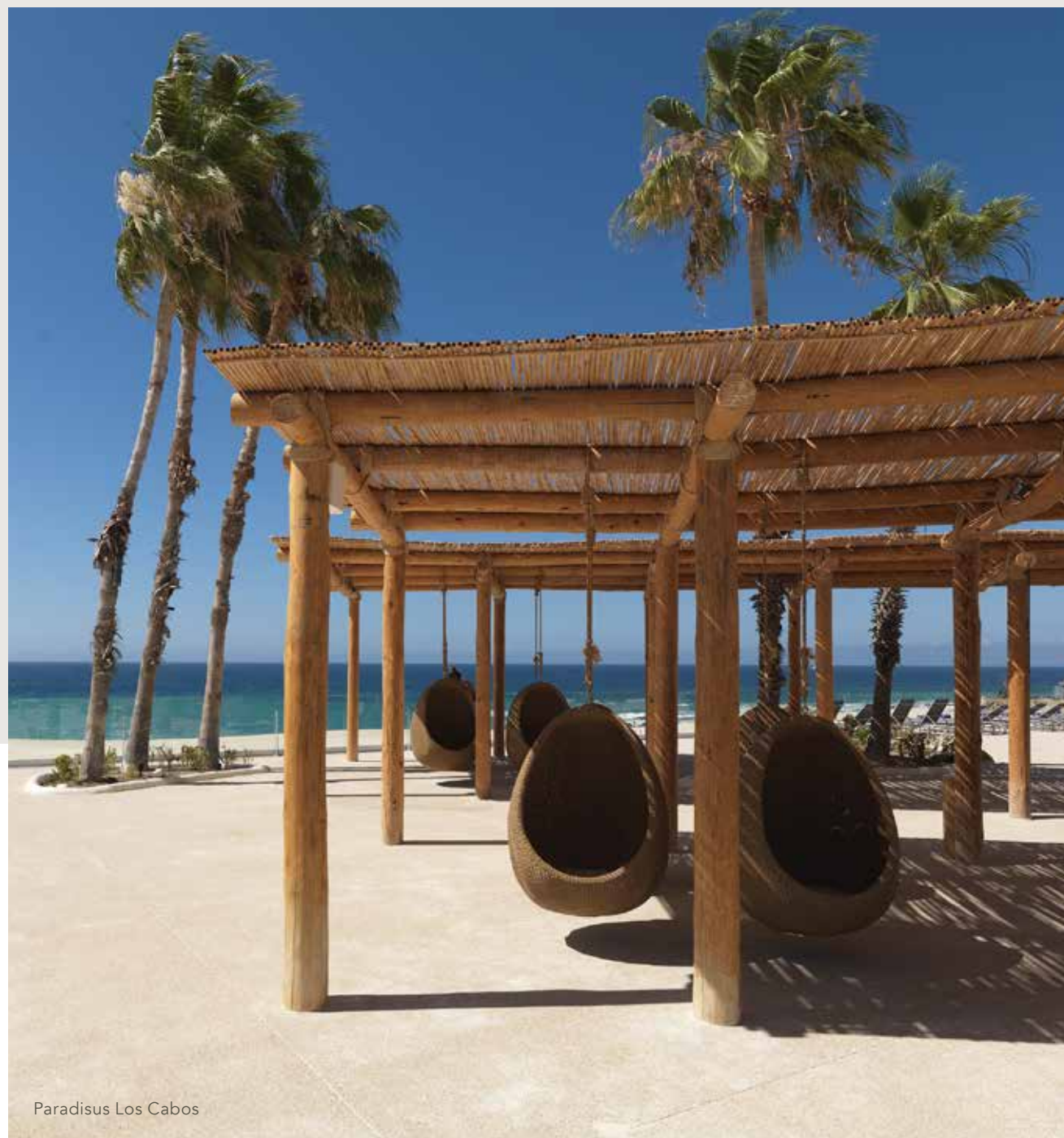
Paradisus Los Cabos