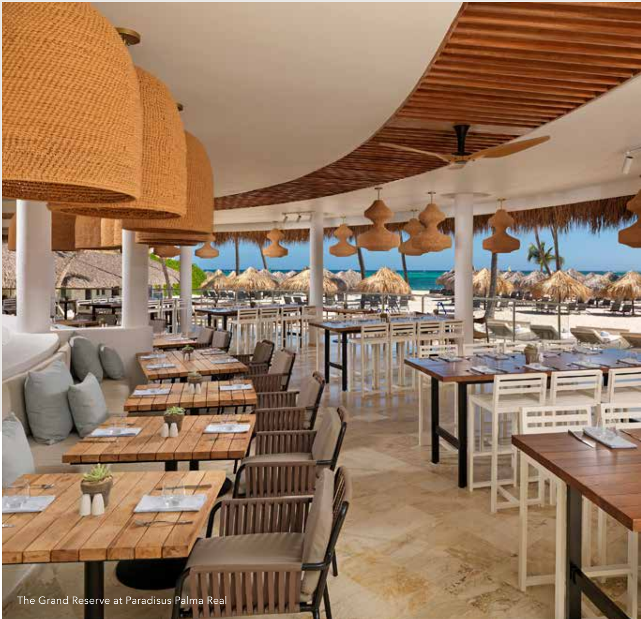
The Grand Reserve at Paradisus Palma Real